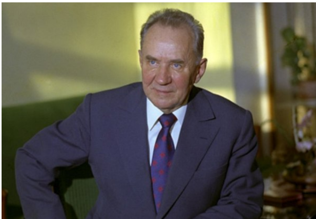
Леонид Ильич Брежнев и Алексей Николаевич " Косыгин "--сын Николая II, Великий